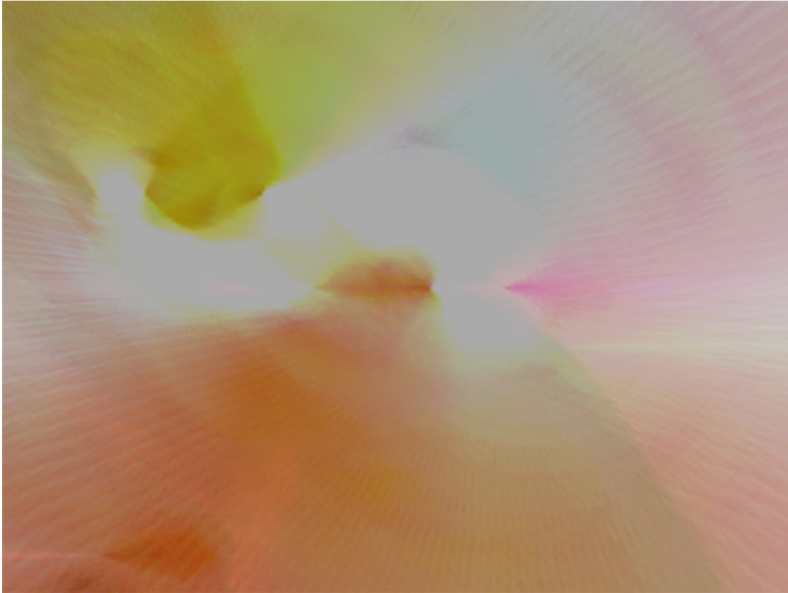
Fig 2. Covertor_19 (2003)