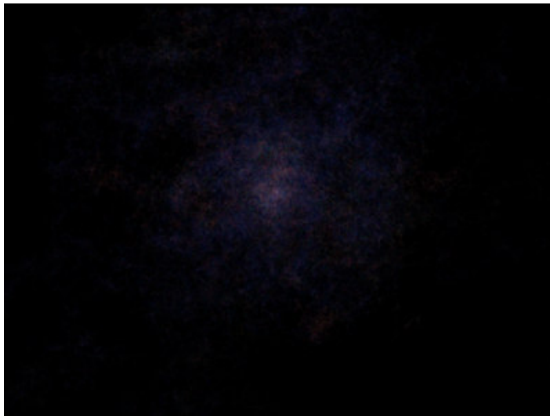
Fig 4 Nebula_crbcw31

I continued to add effects, more pixels and collision detection so that the pixels did not leave the area. Then I had my moment of intuition. I suddenly thought that I could use a low opacity level on the pixels ‘just to see what happens’. The result was a Nebula . Now exactly one month later there are over 50 distinct iterations of Nebula . In some cases, it takes over an hour for anything much to appear on the screen. In other cases large blood-red globules pulsate about. In all cases Nebula eloquently critiques the notion that on-the-web content must be delivered spontaneously (exemplified by ‘skip intro’). Obviously I have not had much time to examine the deeper implications of Nebula , but it is clear to me that it is an interesting area for further research and gives a different perspective on the notion of a digital painting: a different treatment. But note that I am living with the contradiction that I have called these objects Nebula but I do not see them as emulations of space-based nebula. Of far more interest is that so few protocols can produce such a variety of effects and such depth of field and beauty. This is a good example of complexity being the outcome of simple components as championed by Eno. These experiences have given me encouragement to look further into AI and digital art generation.